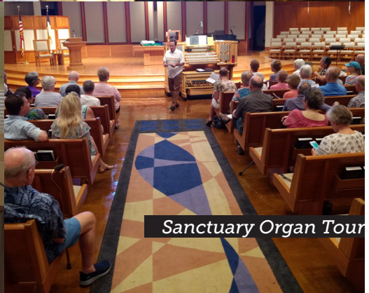
Sanctuary Organ Tour