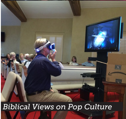
Biblical Views on Pop Culture