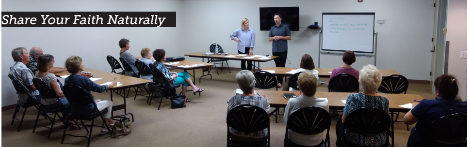
Share Your Faith Naturally