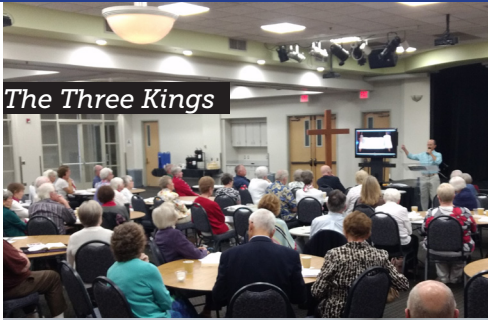
The Three Kings