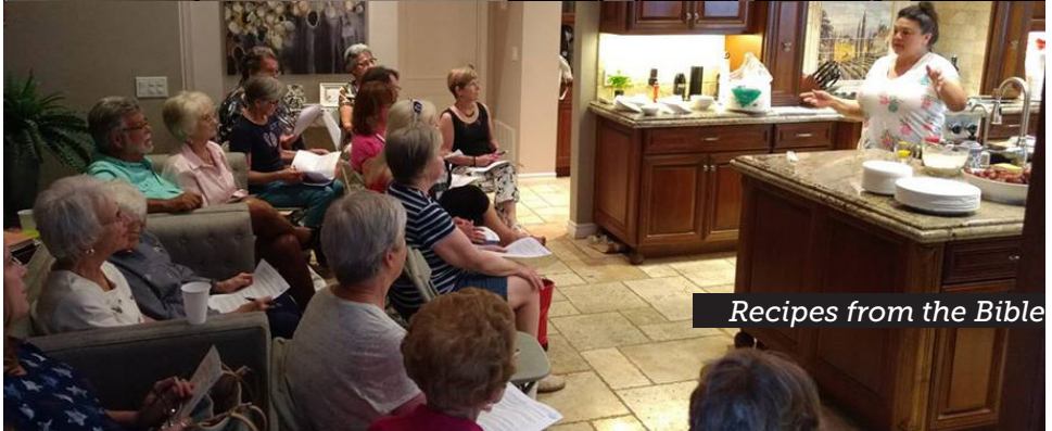
Recipes from the Bible