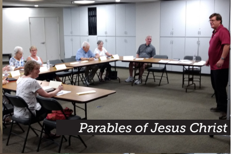
Parables of Jesus Christ