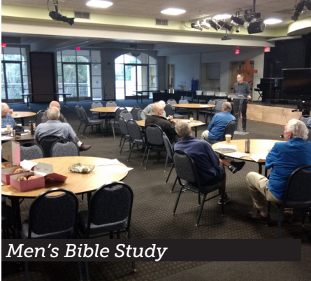
Men's Bible Study