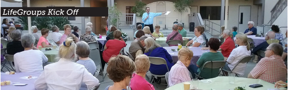
LifeGroups Kick Off